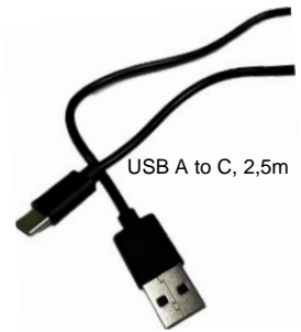
USB A to C, 2,5m

A new SIM card provider supporting all networks in Sweden, Denmark, Norway, Finland.